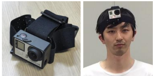
Figure 3. Wearable first person view camera.