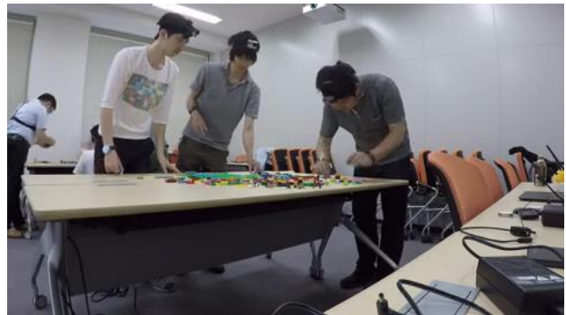
Figure 2. Example of a scene of the conducted activity.

2.2.1. Wearable first person view video camera (Fig. 3). Small but high performance action cameras were attached on the heads of all group members. This method can be used not only in an indoor activity and also in an outdoor one with easy preparation. With this sensing, visual record of the target activity is captured from the subjective and internal viewpoints. Therefore, it is possible to analyze transition of subject's attention during group work. In addition, communications between subjects can be analyzed through voice recordings. The FOV, image resolution and frame rate of the camera are