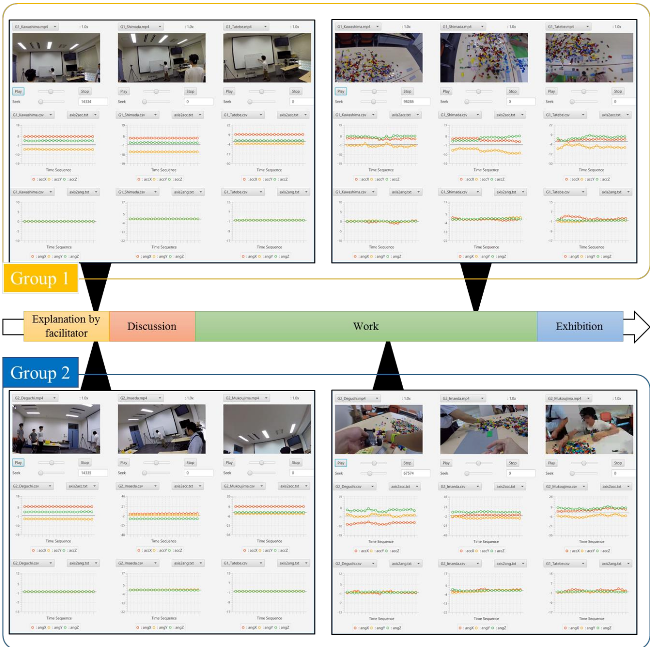
Figure 6. Visualization of group activity a cooperative development work.