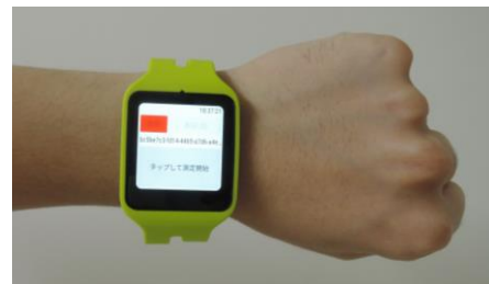
Figure 4. IMU sensor.